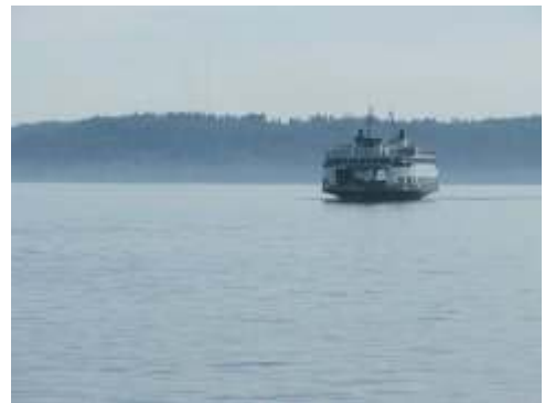
B'ney Mitzvah on Board!